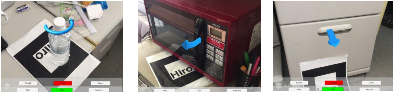
Figure 3. Results

result. If there is an error for the 3D position of the 3D contents, users can correct the 3D position using the SlidAR user interface. In this process, users can correct the 3D position of the annotation by changing the depth value by sliding along to an overlaid 1D line.