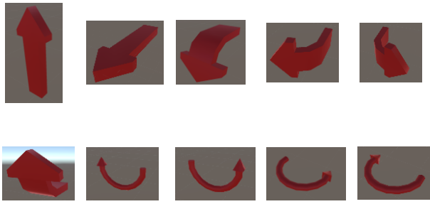
Figure 1. Basic indicators