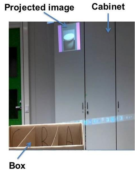
Figure 3. A scene from the laboratory during the task.

The task was to "Find and locate an object from the cabinet and put that object into the box behind." The idea behind this task was to engage each participant in a simple activity. Each participant followed the following step-by-step instructions given over headphones by a researcher located at the remote site a) Open the cabinet door b) Pick up the object from the shelf c) Close the cabinet door d) Put the object onto the correct location of the box (A, B, C). The box visible in figure 3, and each session was video recorded.